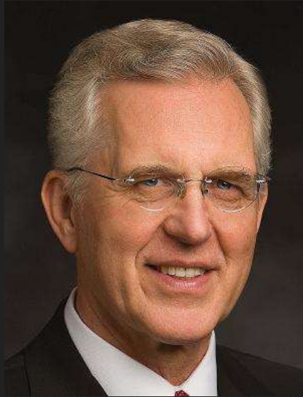
April 2013 Conference

Without His Redemption from death and from sin, we have only a gospel of social justice. That may provide some help and reconciliation in the present, but it has no power to draw down from heaven perfect justice and infinite mercy. Ultimate redemption is in Jesus Christ and in Him alone.