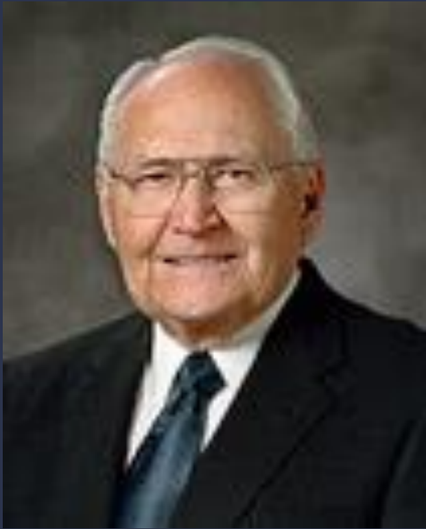
Elder L. Tom Perry