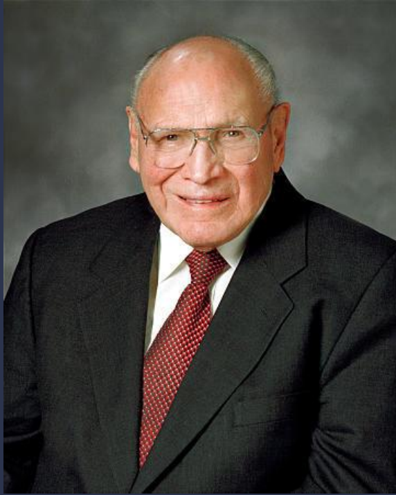
October 2007 Conference

Oh, it is wonderful to know that our Heavenly Father loves us—even with all our flaws! His love is such that even should we give up on ourselves, He never will.